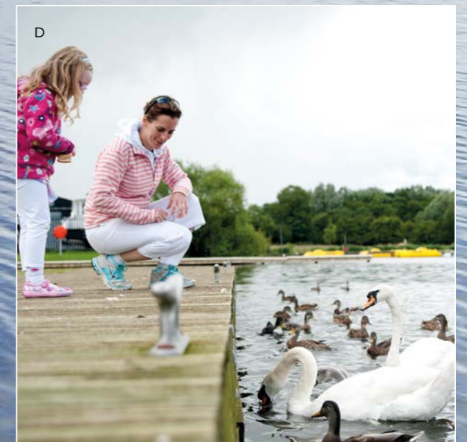
A | Ardress House Gardens B | Newforge House, Restaurant C | Newforge House D | Lough Neagh Discovery Centre